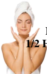
Facial & Massage

EMINENCE FACIAL & MASSAGE COMBO $87.00 1/2 Hour Eminence Facial with a 1/2 Hour Massage SAVE $5